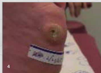
4 Healed ulcer.

This is the foot of a diabetic patient with a chronic wound which could not be healed.