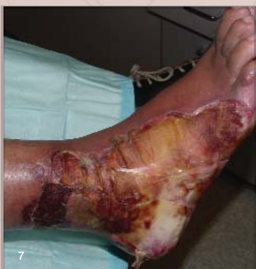
7 One week later after allowing the graft to air dry.

GammaGraft ® was applied on the burn above after cleaning the wound and removing the necrotic tissue.