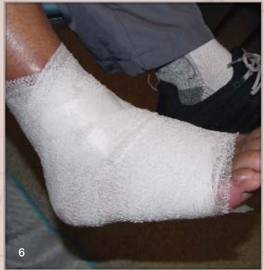
6 Covering with dry gauze. The patient can return home.