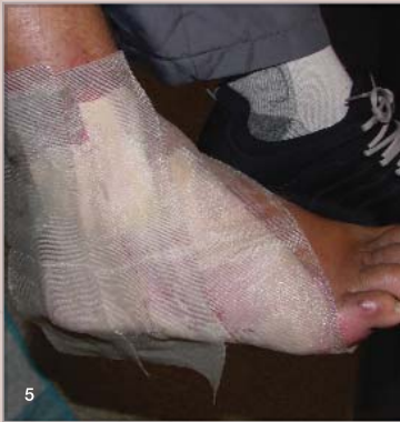
5 Covering GammaGraft ® with non-adherent dressing.