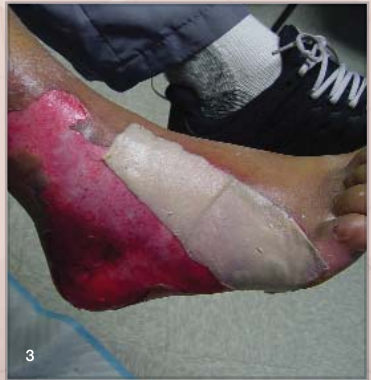
3 GammaGraft ® being applied by the doctor.