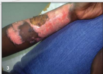
3 GammaGraft® after 14 days.