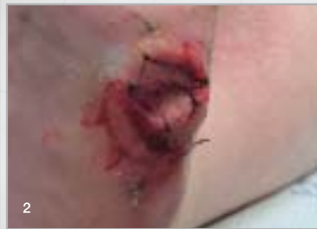
2 GammaGraft® sutured in place.