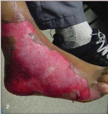
2 The wound after the necrotic tissue removal.