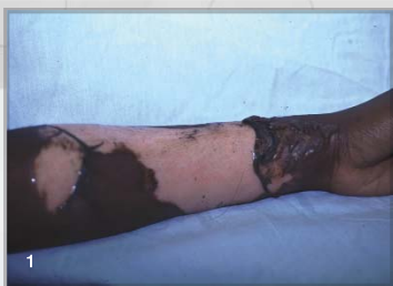
1 Presentation of burn in intensive care.