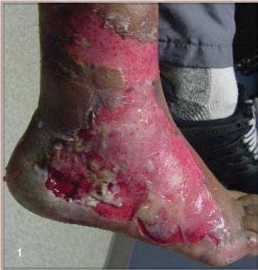
1 Before applying GammaGraft ® , the necrotic tissue has to be removed.