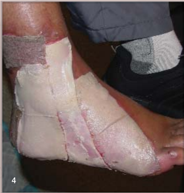
4 GammaGraft ® applied to cover the wound margins.