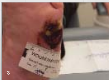
3 GammaGraft® after air-dried, 3 days later.