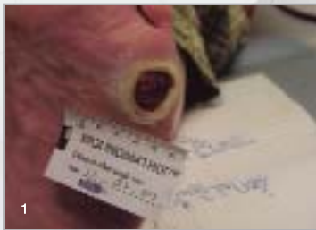
1 Foot ulcer because of diabetes.