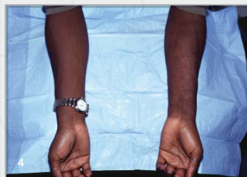
4 Long-term results.

This burn was caused by boiling water. During intensive care the necrotic tissue was removed and the wound was covered with GammaGraft®.