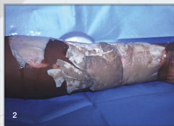
2 GammaGraft® application.